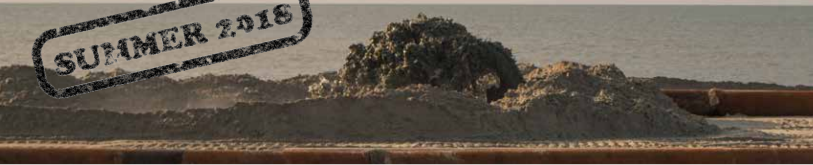
Top photo: Sand being pumped on to Folly Beach. Photo: Myrtle Beach being renourished.