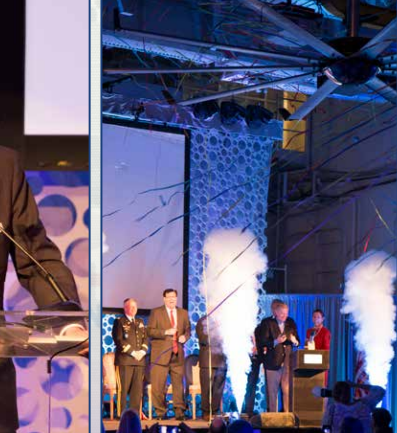
ation. Post 45 project on South Carolina.

The new depth of Charleston Harbor will allow for neo-Panamax container ships to come in and out of the port at all times of the day. Right now, large ships are tide-restricted, causing transportation inefficiencies. The deeper harbor will benefit Charleston, South Carolina and the nation for many years to come.